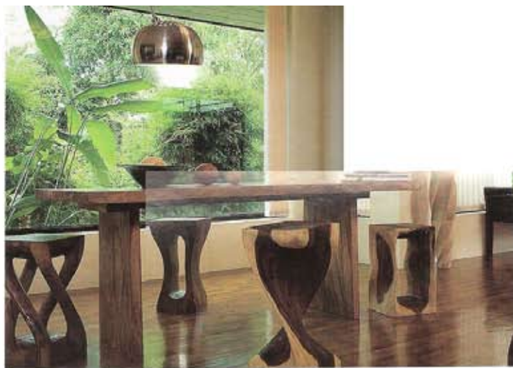
Natural Fine Furnishings (100 Maple Park Blvd., #125, St. Clair Shores, MI 48081) makes a Green statement with an expansive collection of hand-carved furniture pieces — including end tables, wall panels, tables, benches, stools and display stands — and decorative accessories. Call 877.749.7333.

D ive into a pile of new product information and one fact rises to the surface: Environmentally friendly products are serious business. In only a few short years, companies not known to tackle the Green issue are now making eco-friendly statements while new innovators rise to the surface.